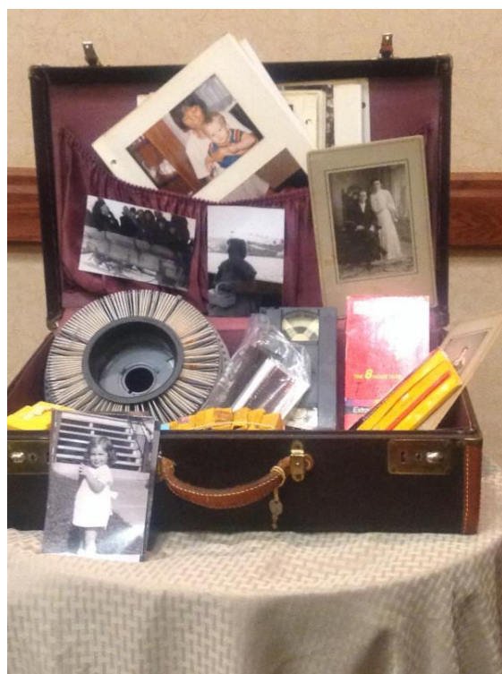
APPO Conference Highlights