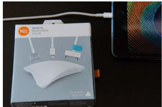
Cord Organizer Giveaway