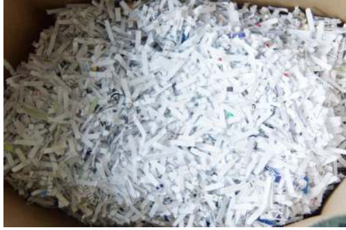
Shredding Events 2Q2014