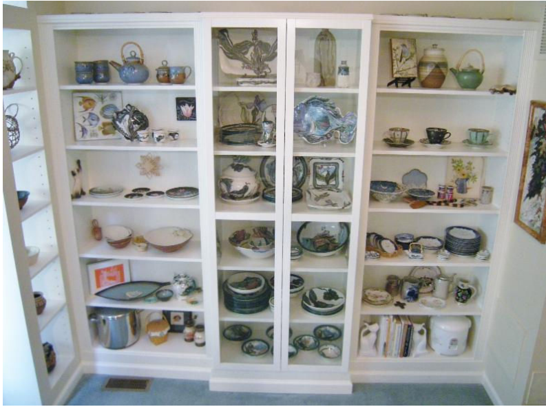
IKEA Billy Built-Ins