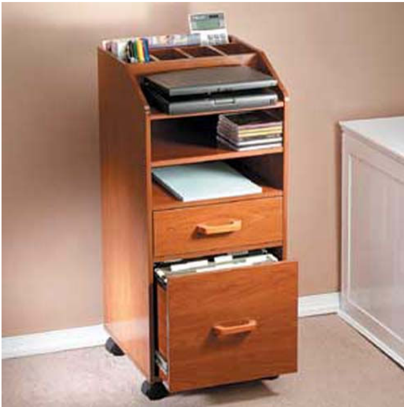
Avoid the Stash & Dash