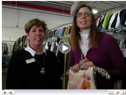
Impact Thrift Makes Money from Rags (click for video)