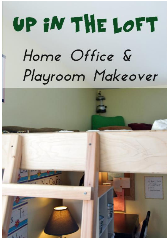
Loft and Home Office Makeover