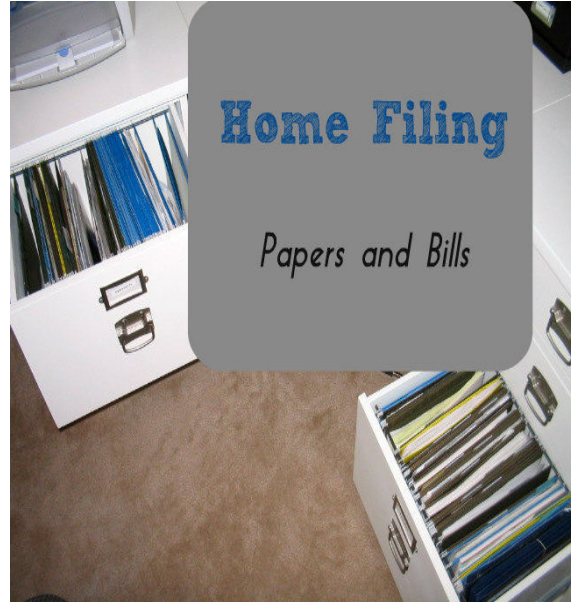
Home File Organizing